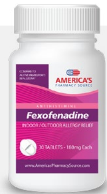
Fexofenadine (Allegra®) 180mg / 30 Count